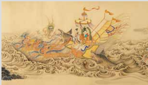
清 丁觀鵬 摹顧愷之洛神圖 Ding Guanpeng's "Copy of Gu Kaizhi's 'Nymph of the Luo River'" Ding Guanpeng (1726-1770), Qing Dynasty

丁觀鵬（活動於1726-1770年），任職清宮畫院，曾從郎世寧學畫。〈洛神圖〉是以曹植（192-232）著名的愛情詩篇〈洛神賦〉為題材所創作的繪畫作品，歷代以此為文本的畫作不計其數，丁觀鵬奉敕臨摹內府所藏〈摹顧愷之洛神圖〉卷雖是摹作，然山水造型已自古典畫樣轉為成熟的金碧山水，並以西洋明暗設色法與定點透視法，營造合乎視覺經驗的畫面。清宮畫院以古典圖式與傳統母題，融合西方畫技，展現鮮明的時代性格，正是清宮「摹古創新」的最佳範例。