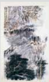
民國 張大千 山水

Exhibition Area I (Main Building): Galleries 105, 107 Exhibition Dates: 2012.01.20–2012.04.23