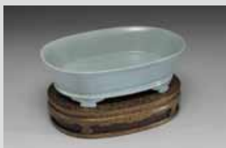
北宋 汝窯 青瓷無紋水仙盆 Narcissus Basin in bluish-green glaze Ru wane, late 11th - early 12th Century

此一展覽擬展出國史故宮博物院所藏刻有乾隆皇帝御製詩瓷器，以及二十件可以和乾隆朝繪製的陶瓷圖冊相對照的作品。以透過具體典藏記號的角度，引導觀眾瞭解乾隆皇帝的鑑賞觀和他收藏的陶瓷。