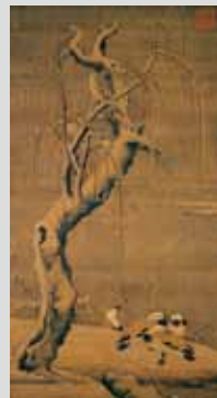
明 呂紀 雪景翎毛 Snowy Landscape and Birds, Ming dynasty, Lü Ji (ca. 1429-ca.1505)

Lü Ji (1429 – 1505), style name Tingzhen, sobriquet Leyu, a native of Ningbo in Zhejiang, was a famous court painter of the middle Ming dynasty. According to historical records, Lü Ji first studied the painting style of Bian Wenjin (ca. 1356-ca. 1428), an important early Ming court painter of bird-and-flower subjects and had the opportunity to view and copy famous paintings of the Tang and Song dynasties. At court Lü Ji further learned from the famous painter Lin Liang (ca. 1424-after 1500), finally developing a style of his own combining "fine-line" and "sketching-idea" manners as well as splendor and naturalness. Lü Ji excelled at rendering emotive scenes, using mostly brushwork rounded and upright with force. His colors were bright and beautiful, depicting warmth and solidity.